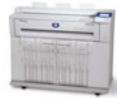
Digital Copier/Printer with Scan-to-File/Net