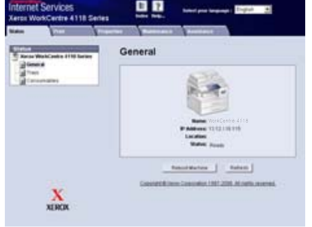
Manage your printer from a Web browser with CentreWare IS software included in the optional network card.