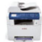
print | copy | scan