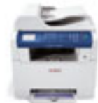
print | copy | scan | fax

For more information, visit us at www.xerox.com/office